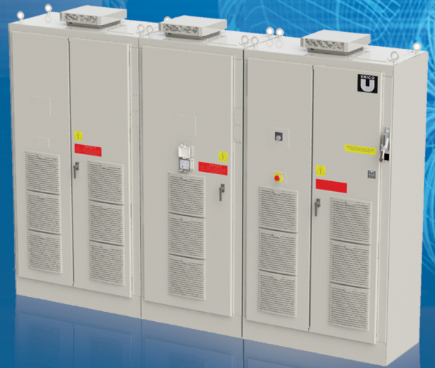
Air Cooled Configuration