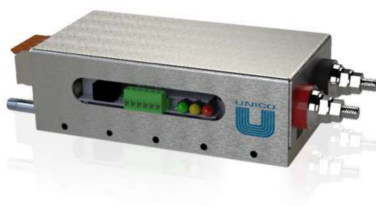
One Channel Water Cooled