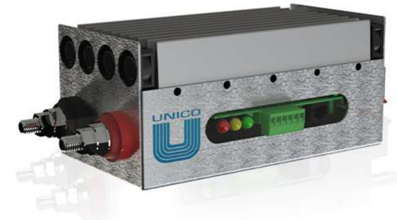
One Channel Air Cooled