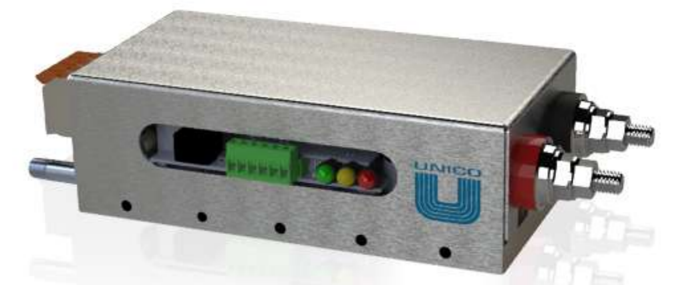
IDAC Cell Channel for testing and formation

The BAT300 has an incredibly small size which allows integrators to mount the complete power electronics - input power conversion, isolation, DC output control - extremely close to the cell. It's ultra-high efficiency of better than 98% and complete bi-directional charging and discharging provide a new level of energy efficiency in the lab or Gigafactory.